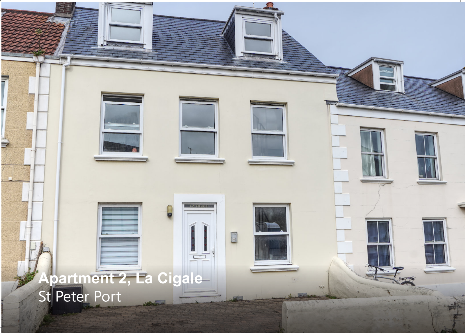
Apartment 2, La Gigale St Peter Port